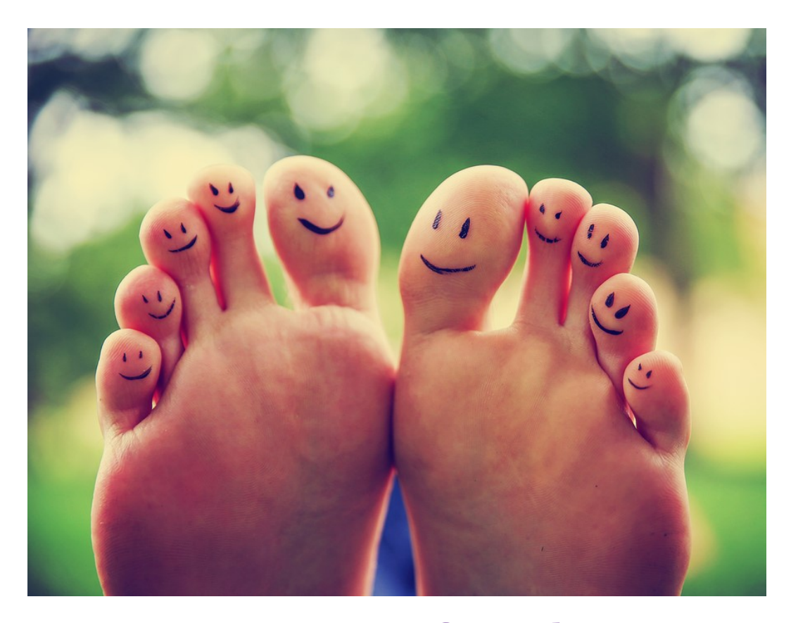
You Must Know Before Choosing A